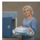
FREE OPERATOR TRAINING